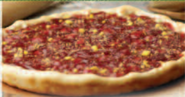
Cherry Dessert Pizza