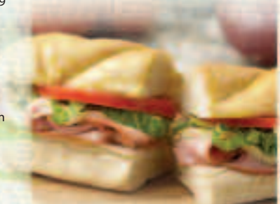
Ham & Cheese

Choice ground steak topped with sautéed green peppers, mushrooms & onions, provolone cheese & pizza sauce. Baked on an Italian roll. 5.99