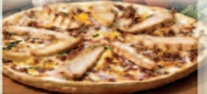
White Chicken Pizza

Visit us on the web at hometownpizza.com