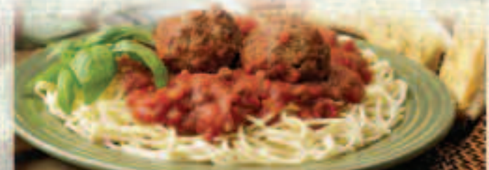
Spaghetti with Meatballs

Linguini baked in creamy Alfredo sauce with fresh mushrooms & tomatoes. 6.29